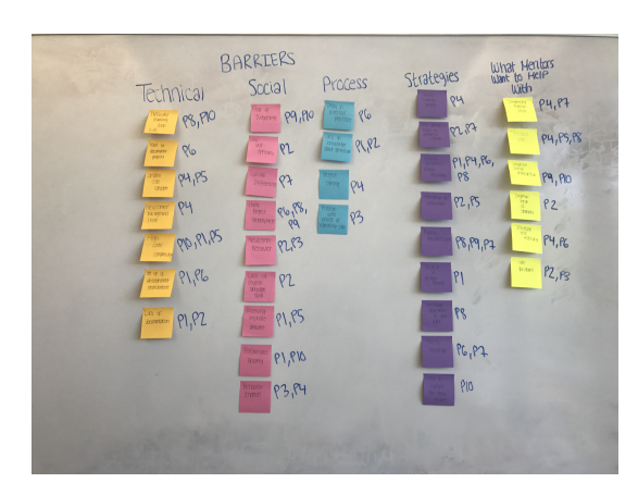
Fig. 2 Card sorting session

weekly meetings in which all the authors discussed the resulting codes and classification until we reached an agreement.